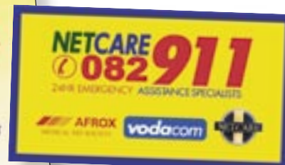
Sticker and information leaflet